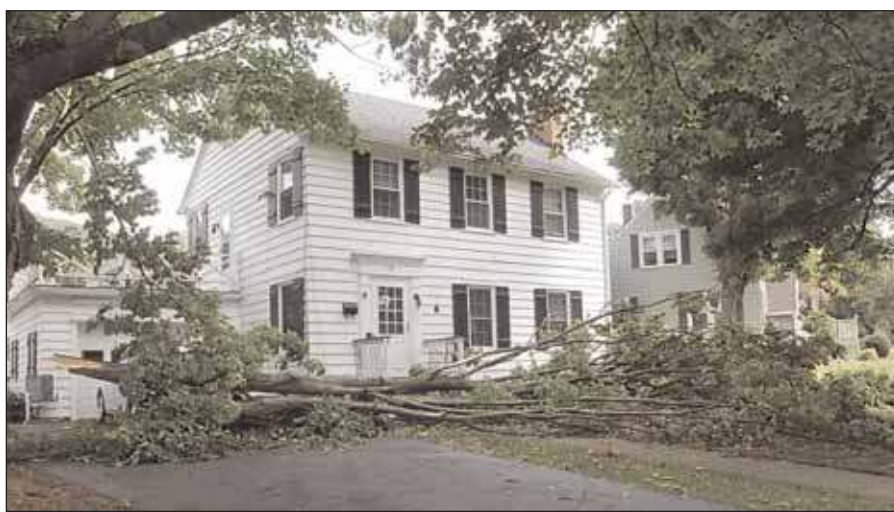
ERIC WENSEL | THE LEADER

More than 100,000 people in upstate New York lost power as the result of a wind storm caused by the remnants of Hurricane Ike.