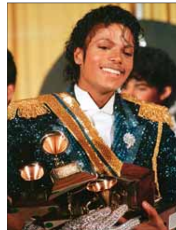
In this February 1984 file photo, Michael Jackson is seen backstage at the 26th annual Grammy Awards.

Jackson died at UCLA Medical Center after being stricken at his rented home in Holmby Hills. Paramedics tried to resuscitate him at his home for nearly three-quarters of an hour, then rushed him to the hospital, where doctors