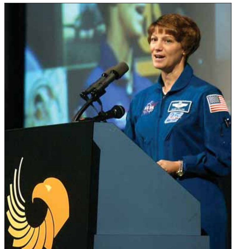
THE LEADER FILES

Eileen Collins speaks in June 2006 at the Wings of Eagles Discovery Center in Big Flats.