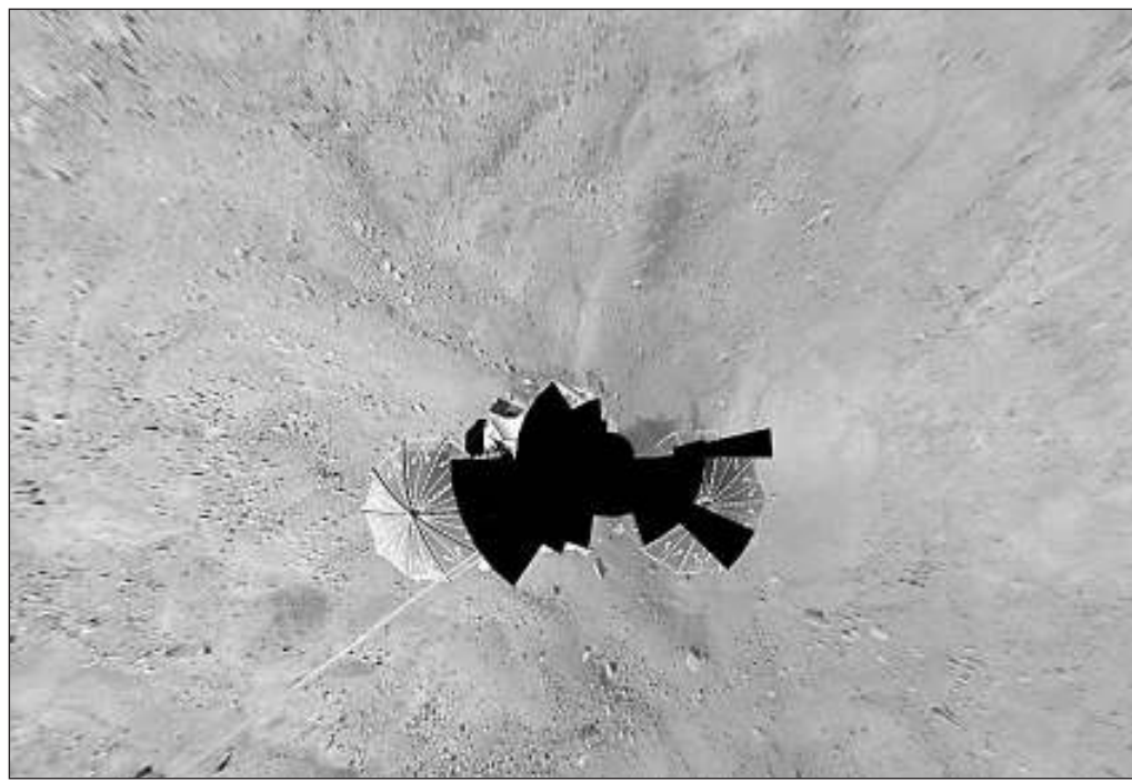
This image provided by NASA shows the full-circle panoramic view of the Phoenix Mars Lander taken during the first several weeks after NASA's Phoenix Mars Lander arrived on an arctic plain on Mars in late May. The Phoenix spacecraft "tasted" Martian water for the first time Wednesday.

Researchers were able to prove the soil had ice in it because it melted in the oven at 32 degrees — the melting point of ice — and released water molecules. Plans called for baking the soil at even higher temperatures next week to sniff for carbon-based compounds.